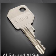
ALS-5 and ALS-6 Adapted Length Profile