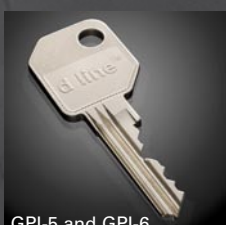
GPI-5 and GPI-6 Basic Profile System