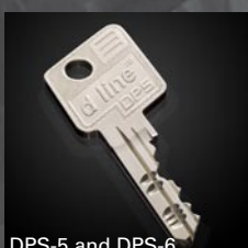
DPS-5 and DPS-6 Double Profile System